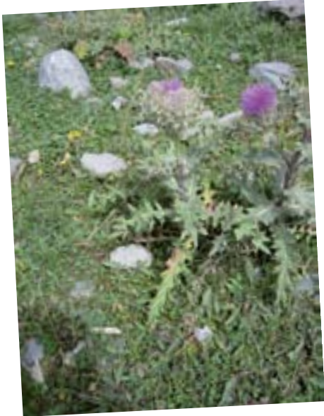
Did the Scots drop some of their thistles on the way through the Caucasus?