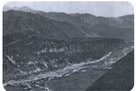
Col Pearse's view of the river valley from The National Message article in 1937