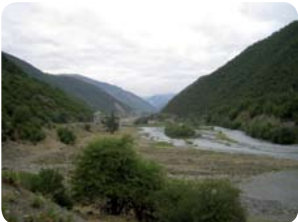
Travelling north towards the Caucasus following the river. Note the wide flat bed of the river that could easily handle the migrations of Israel with all their livestock