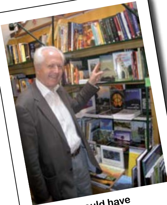
I would have worn my tie...