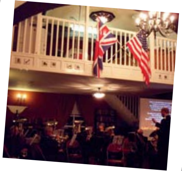
Not blowing our own trumpets