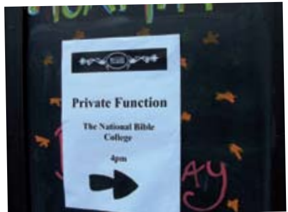
We will go public next time