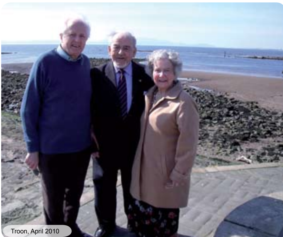
Troon, April 2010