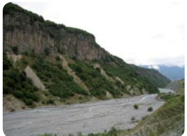
Notice the same mountain structure, Col Pearse was much higher up the mountain side now close to Russian occupied South Ossetia