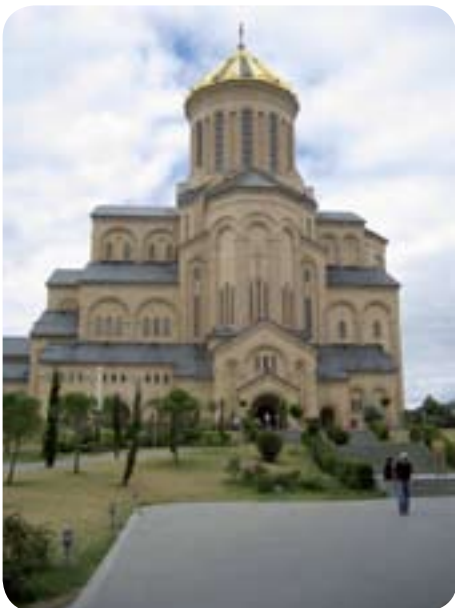
The Tbilisi Holy Trinity Cathedral, constructed between 1995 - 2004, is the largest religious building in Tbilisi and the Caucasus to celebrate 1500 years of autocephaly and 2000 years from the birth of Christ