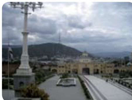
A view over the modern section of Tbilisi from the new cathedral