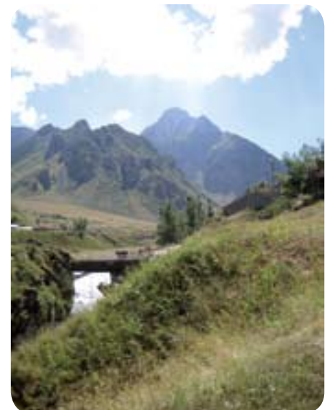
We were able to find the same spot as Col Pearse near a small village called 'Sioni'