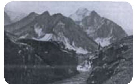
Mount Zion as named in the Caucasus range taken by Colonel Pearse