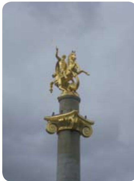
Statue of St George having the victory over the dragon - One of the patron saints of Georgia