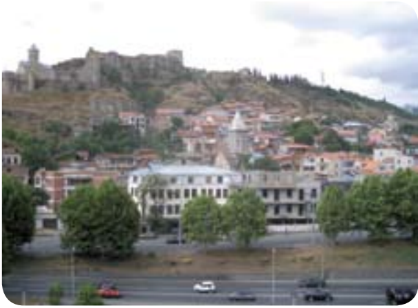
Section of old Tbilisi, the capital of Georgia, with the Narikala Castle