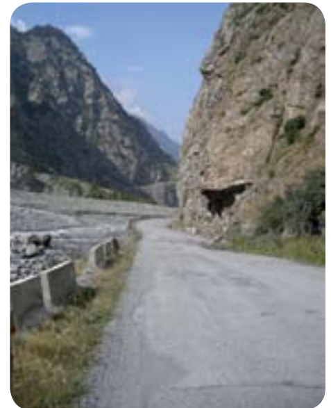
Through this Gorge lay the flat open expanse of South Russia, accommodating the migration of the Israelites in a north and west direction

The Mystery of the Lost Tribes of Israel will be an exciting addition to our work – please pray for its success in reaching a wide audience and be ready to buy the DVD to see it for yourselves.