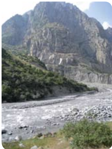
At the Darial Gorge, the gap through the Caucasus mountain range. Some mountains reach 16,000 feet