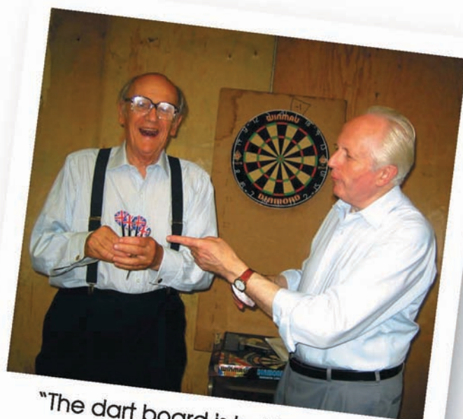
"The dart board is behind you..."