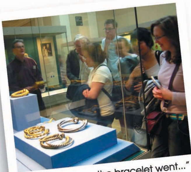
"So that's where the bracelet went..."