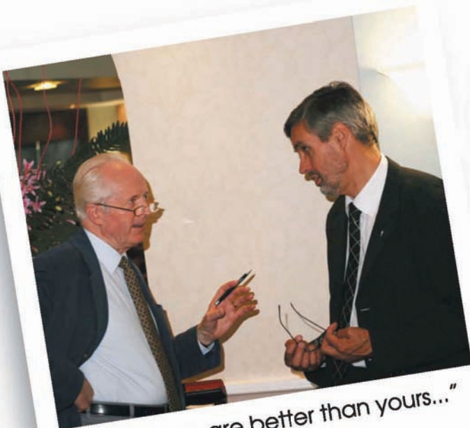
"My glasses are better than yours..."