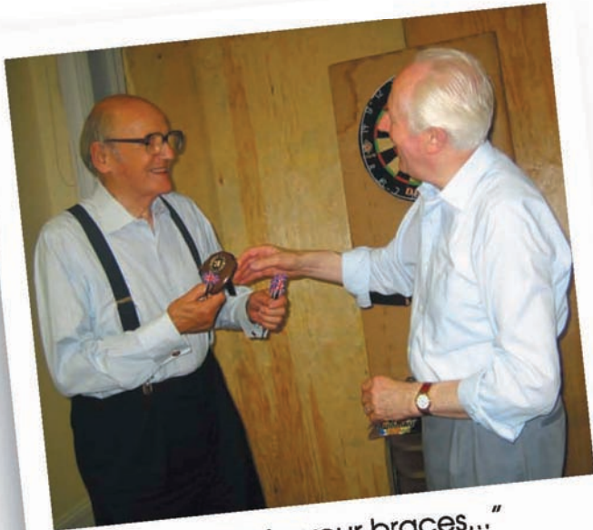
"Pin this to your braces..."