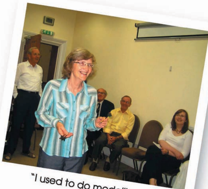
"I used to do modelling..."